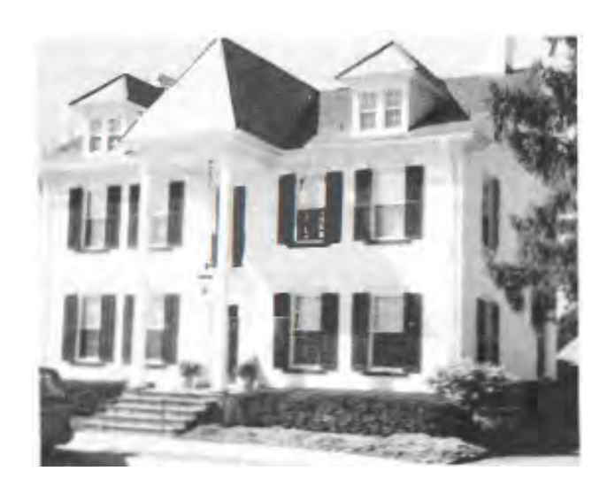
Hanna Stroud Starbird House - 1790