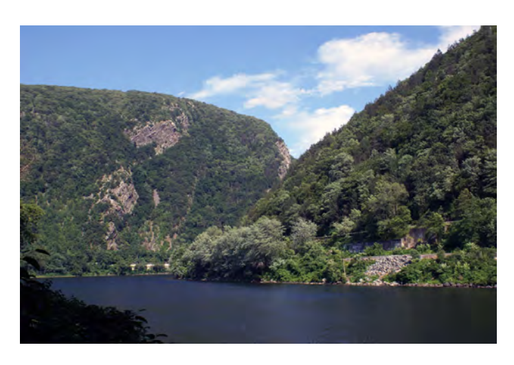
Delaware Water Gap

By the eighteenth century the migrations of the Pennsylvania Germans, Welsh and English coming from Philadelphia north to the Poconos came through the Wind Gap. Others came across from New Jersey. It wasn't until the end of the 18th Century, however, that the flow from the south eclipsed that from the north.