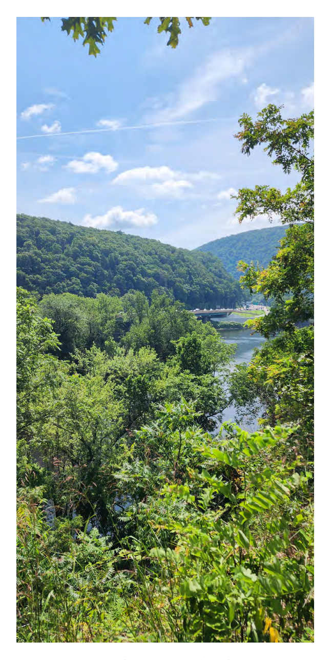
2023 view of Resort Point Overlook