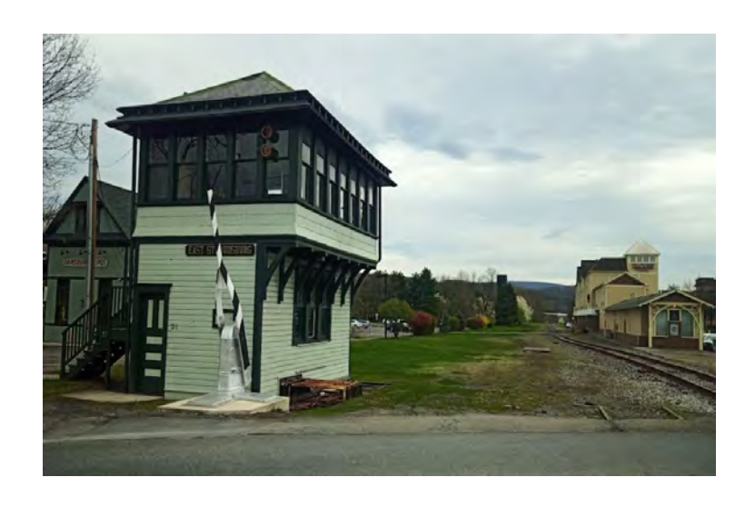
Railroad Switching Tower, East Stroudsburg