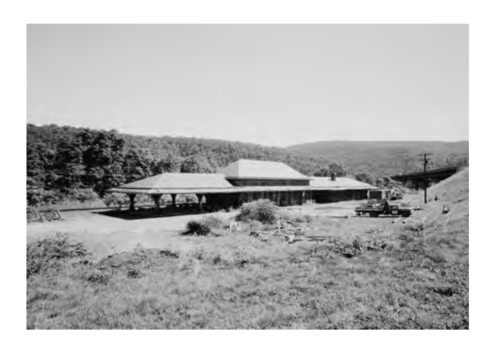
Delaware Water Gap Railroad Station

The Delaware Water Gap Station of the Delaware, Lackawanna and Western Railroad. The original station was constructed in 1856. The one you see now was built in 1903 and closed in 1953. It served on the main line between East Stroudsburg and Blairstown, N.J.