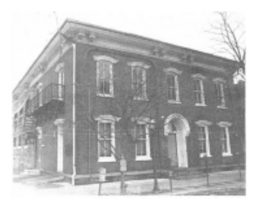
Former Monroe County Jail - 1875