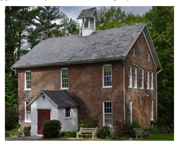
Dutot School - 1870