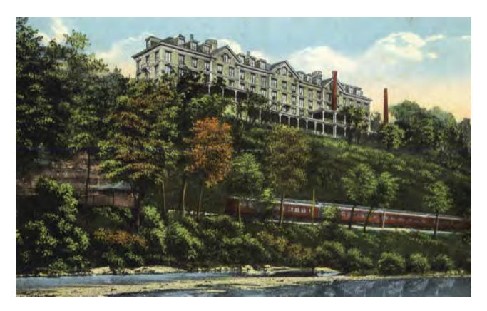
Kittatinny House - 1829

Once 611 re-opens, continue along 611 South by vehicle until you get to Resort Point Overlook. Park in the parking area for Resort Point Overlook. You can get out of the vehicles. This is where the Kittatinny House once stood.