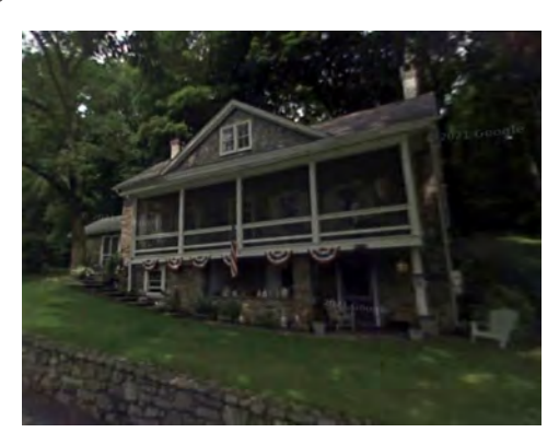
Old Stone House - 1734

Continue along Cherry Valley Road towards Delaware Water Gap. Approx. 4 miles on your right will be an old stone house (1325 State Route 2006).