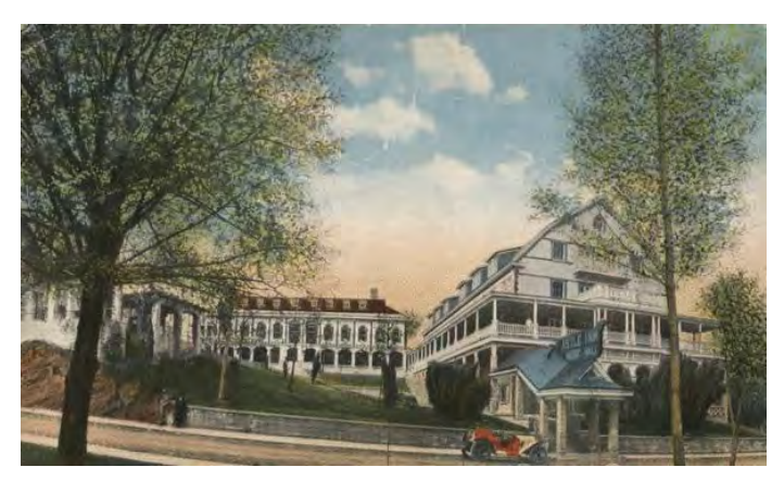
Castle Inn - 1909

• Turn south on Main St and head back to Delaware Ave, making a left onto Waring Drive.