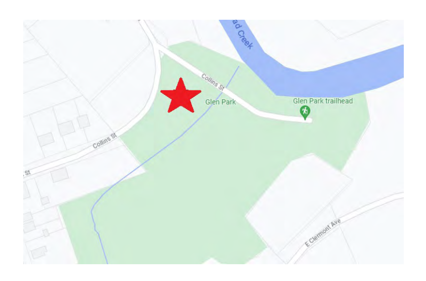
End of first part of Walking Trail - Glen Park - near 152 Collins Street, Stroudsburg, PA 18360