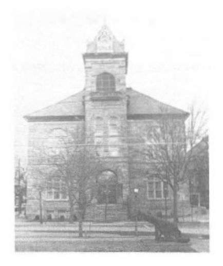
Courthouse Square - 1836